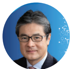
Prof. Shigeo Akira (Japan)