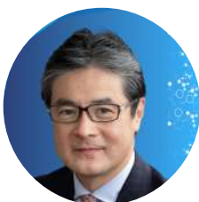
Prof. Shigeo Akira (Japan)